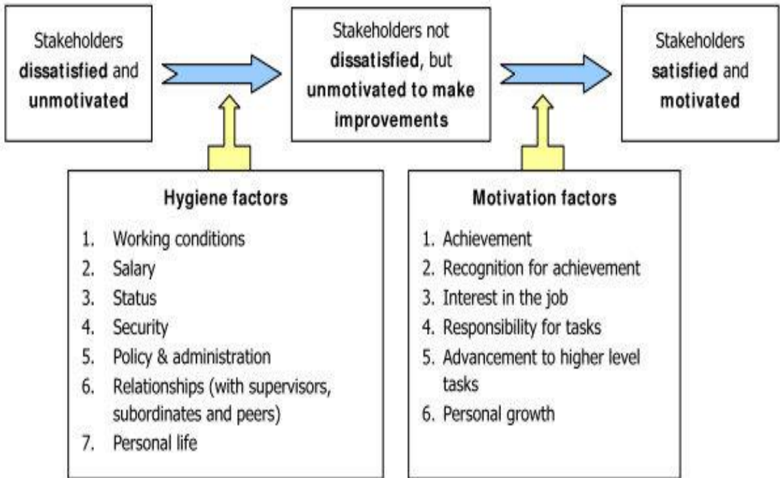
Fig: Motivation and Hygiene Theory

responsibility. Adding that there are few factors such as recognition, achievement and growth which are key factors as motivators. These factors do not dissatisfy them if they are not present. But if it is present then the inspiration of employee will be very high and satisfied (Bogardus, 2007). When individual value hygiene factors the dissatisfaction cannot be avoided. Then dissatisfaction occurs and motivation cannot remain.