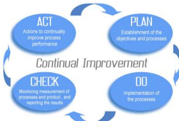
Fig. 3 PDCA Cycle

It is obvious that Standards set by management should be reviewed in a constant way. There should be continuous collecting and analyzing data on defects, and encouraging teams to conduct problem-solving activities. In this case, the standards will be in a proper form, and if deviations occur, the individuals realize that there is a problem. Then employees will review the standards and either correct the deviation or advise management on changing and improving the standard. Accordingly, Imai developed the PDCA cycle (plan-do-check-act), known as Deming cycle to be used and employed in kaizen philosophy. It is a never-ending process and is a basis for continuous improvement, as depicted in figure (2).