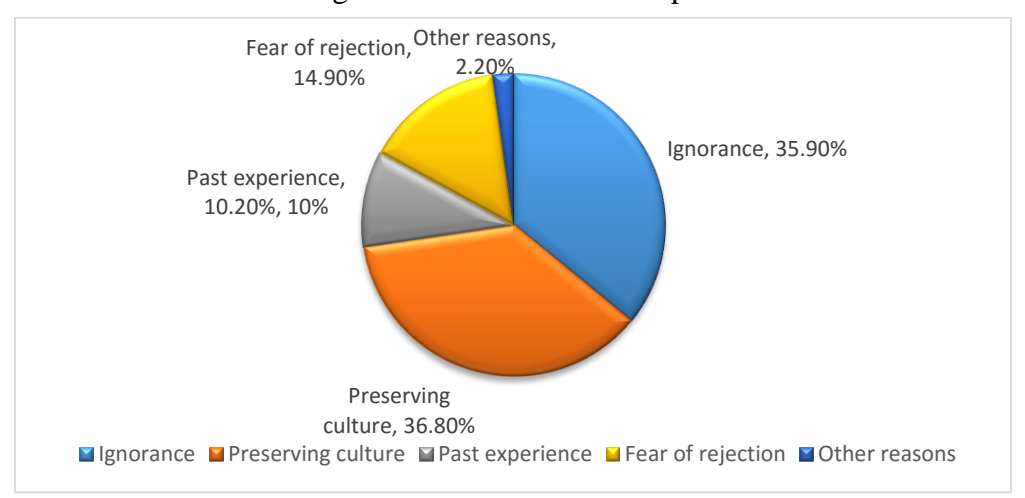
Figure 2: Factors contributing to continued beliefs and practices

A smaller percentage 10.2% of the women who responded attributed the continuity of harmful beliefs and practices to past experiences. They explained that having seen other women in the neighborhood facing the consequences of not practicing the beliefs held they had to practice them to avoid what happened to others from happening to them. Figure 2 below shows factors contributing to continued beliefs and practices